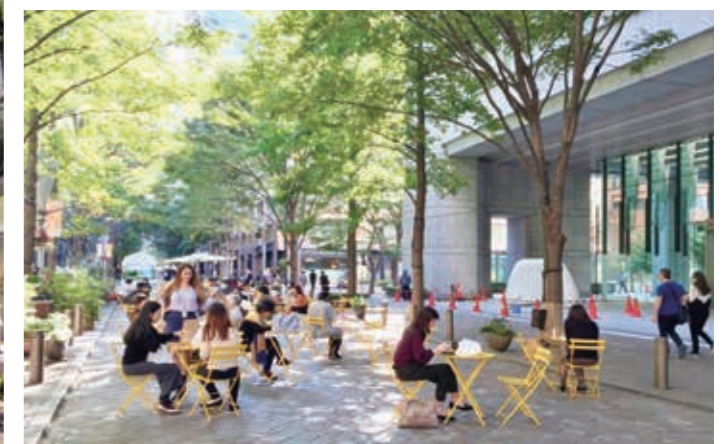
Urban Terrace pedestrian space on closed street