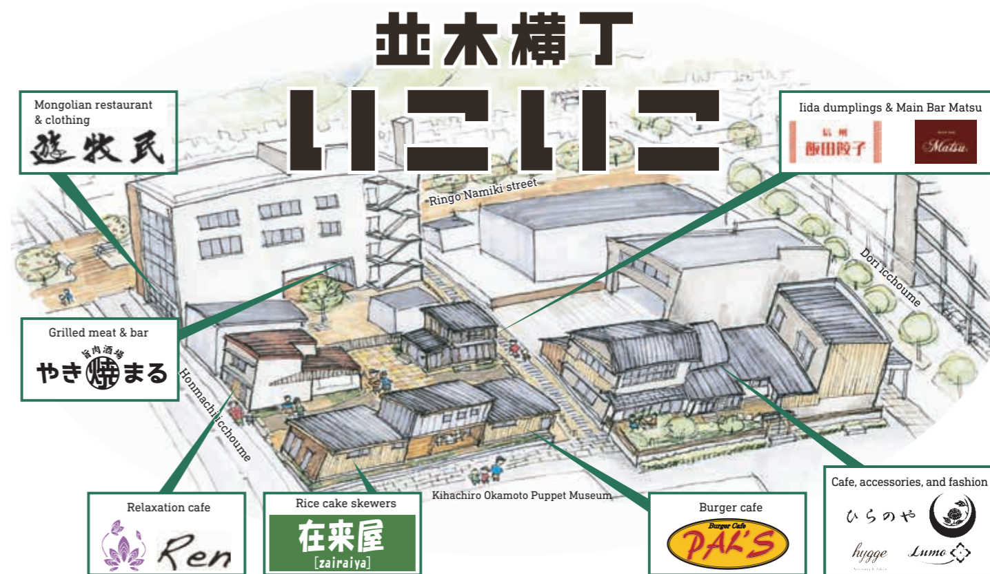
The entire alleyway