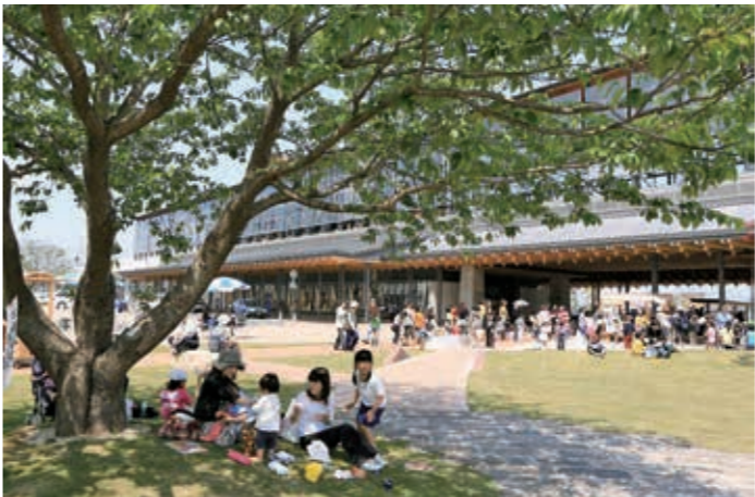
The park has become a place for local residents to relax