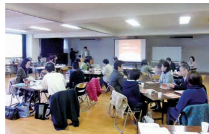
Startup camp to train business owners