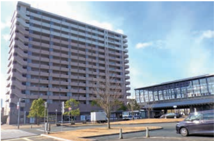
New retail stores facing the street revitalized the area