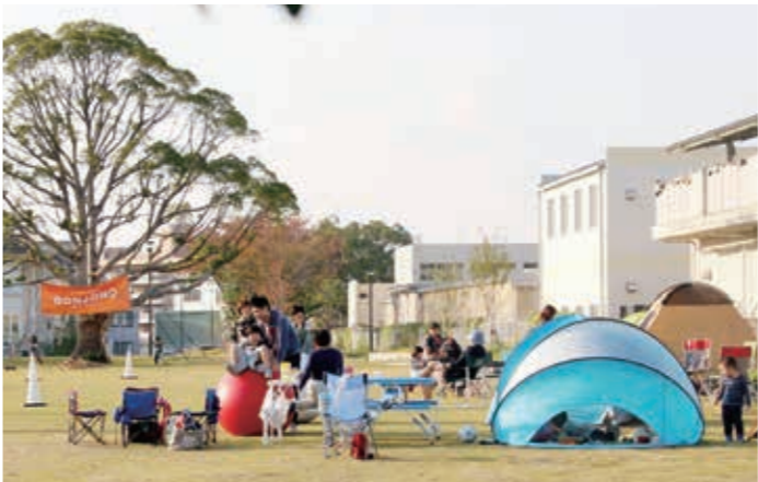
Camping event at a local park