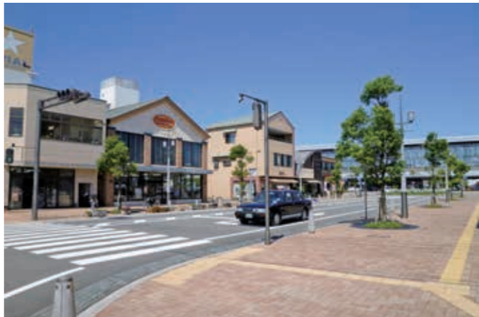
Private development, including apartments, followed the reconstruction of the station and plaza