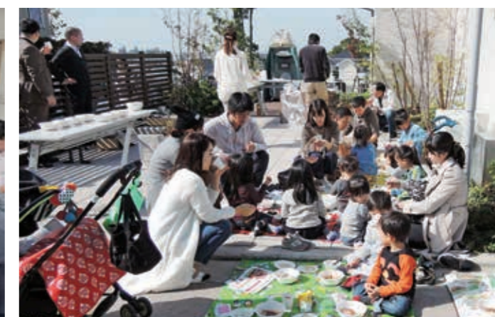
Disaster preparedness event