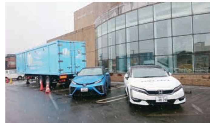
Mobile hydrogen station and fuel cell vehicles