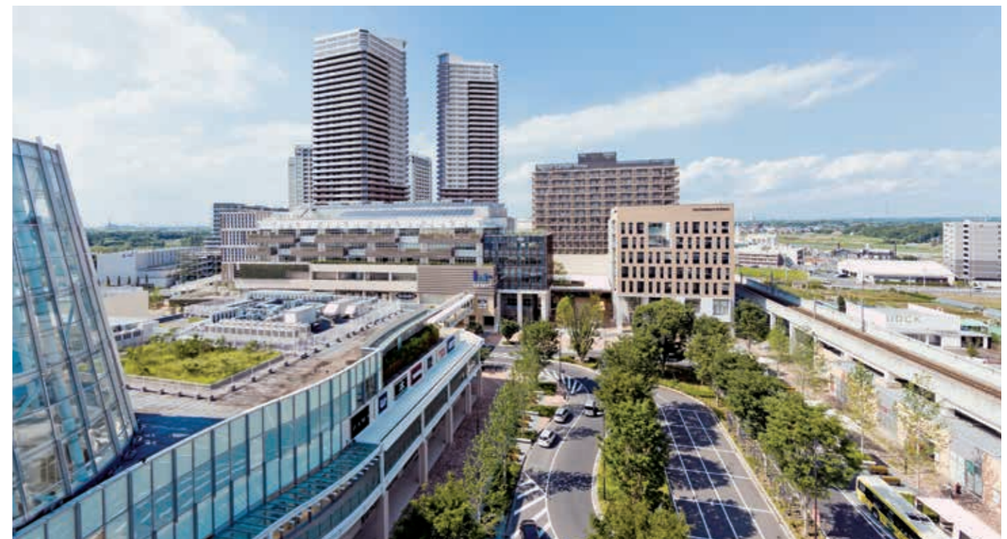
The Gate Square commercial center and residential buildings at the center of the district