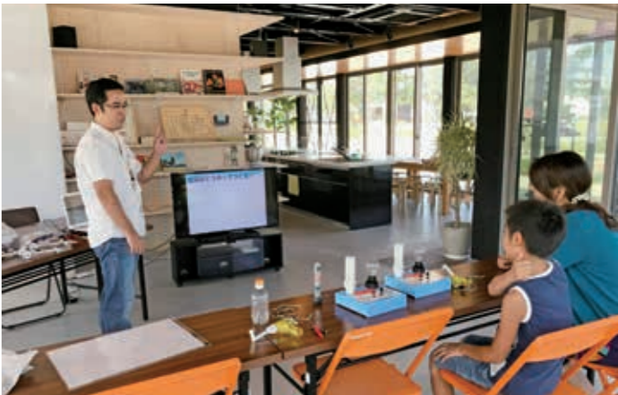
Environmental learning event