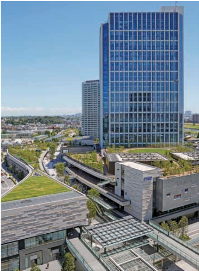
Commercial facilities in front of the station and office towers