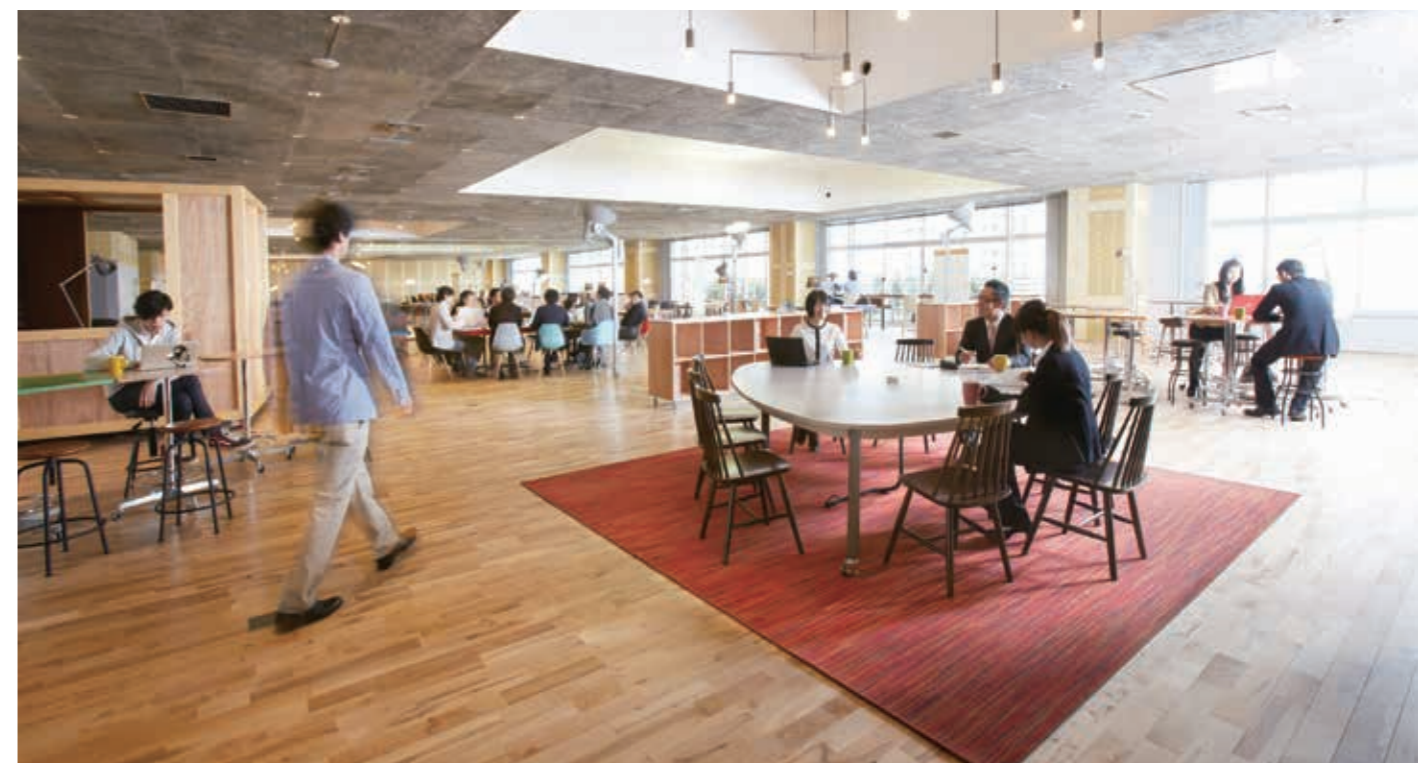
KOIL Park co-working space