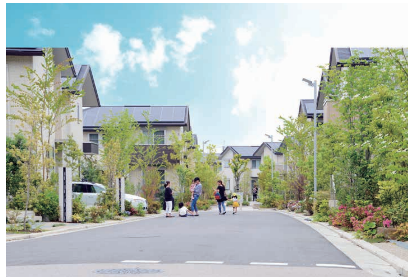
Typical street in the development