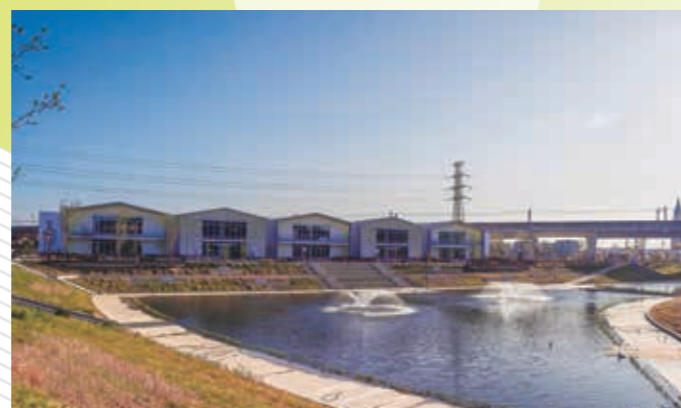
Retention basin integrated into park space