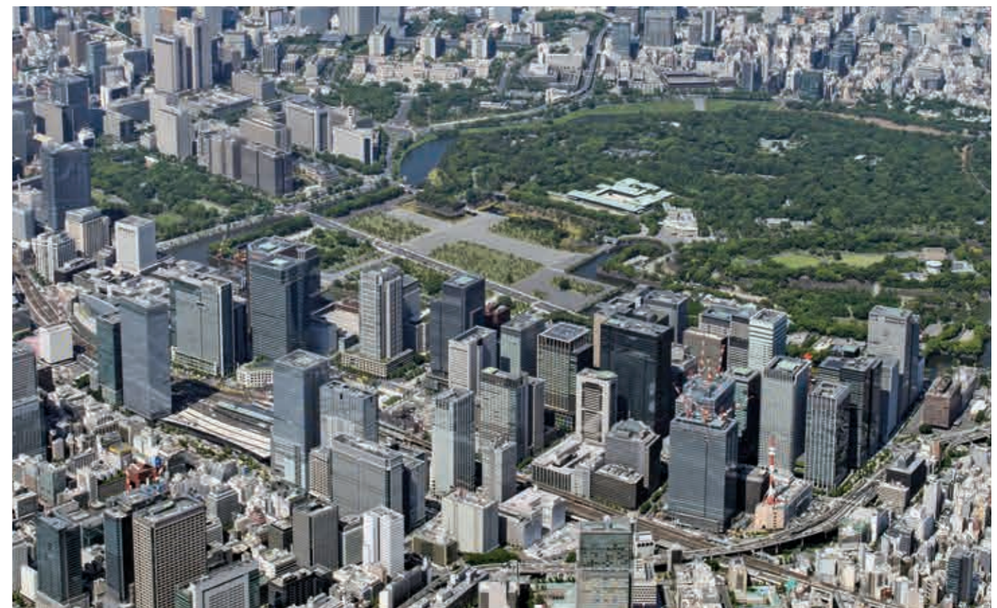
The office district between Tokyo Station and the Imperial Palace

In recent years, seminar salons and other social spaces have been opened to foster an innovative environment where new ideas and business emerge from professional interaction between companies and across industries.