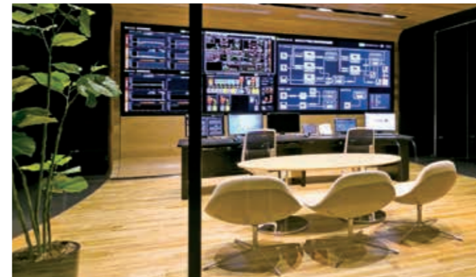
Energy management system