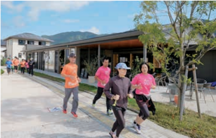
Life Workshop community center