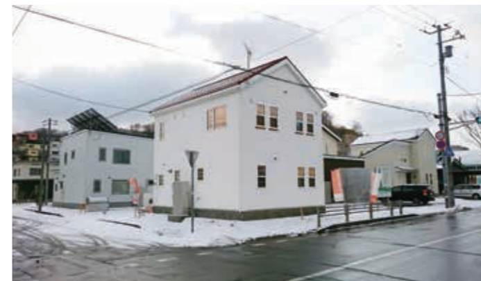
Residential area with fuel cell-equipped homes