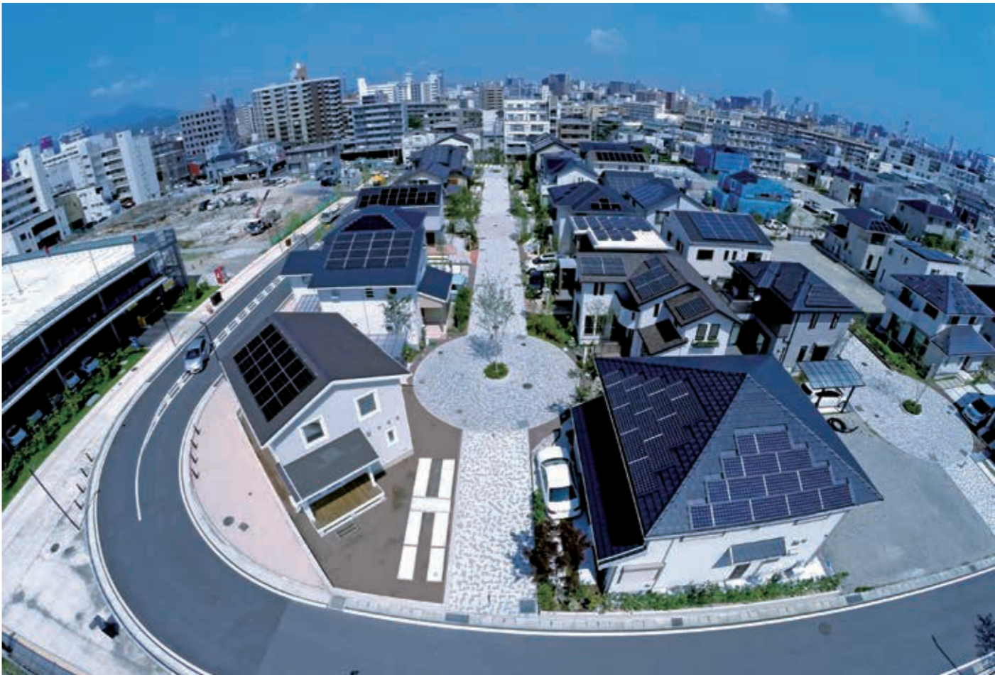
Solar panels installed on houses