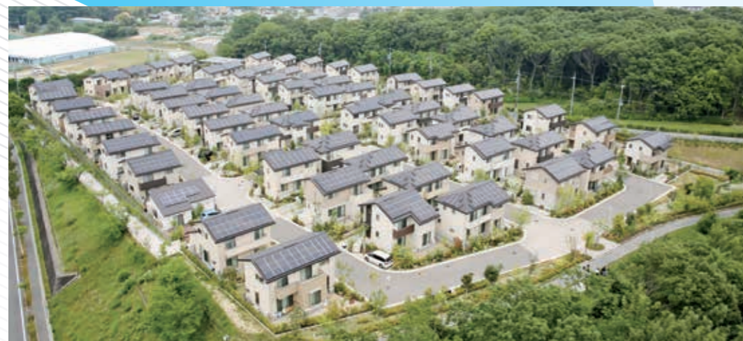
The entire district

Sale of solar electricity and electric car sharing provides the management organization with additional income to sustain its activities besides the management fees collected from residents.