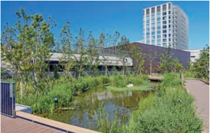
Green Roof is a part of focus on nature