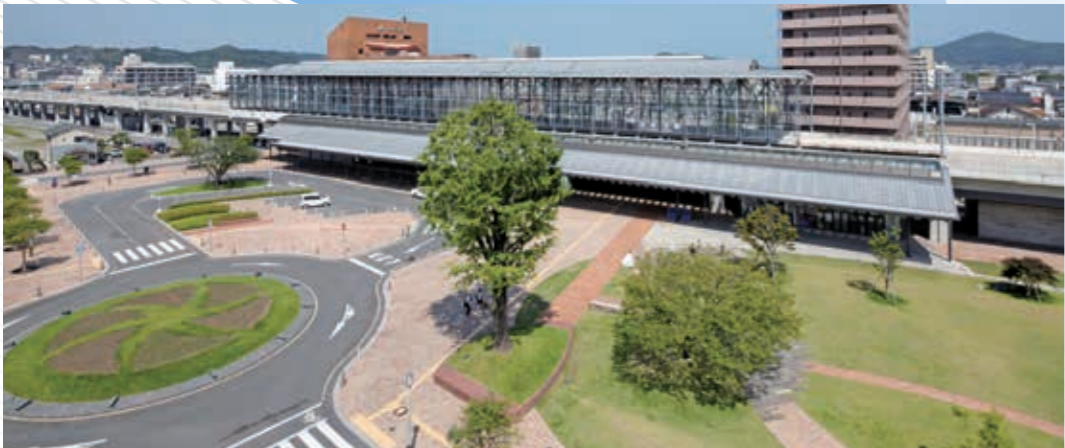
Compact city planning focused on the station and plaza area

trict. With this, they created space for alleys and a parking lot, thereby improving visitor convenience and the appeal of the commercial district. During the planning process, a conference of urban design experts was established to ensure a consistent, uniform design, and incorporate the opinions of users gathered through various conference discussions. In addition, extra-curricular classes for elementary, middle, and high school students were staged as a way of educating the next generation of leaders about town planning.