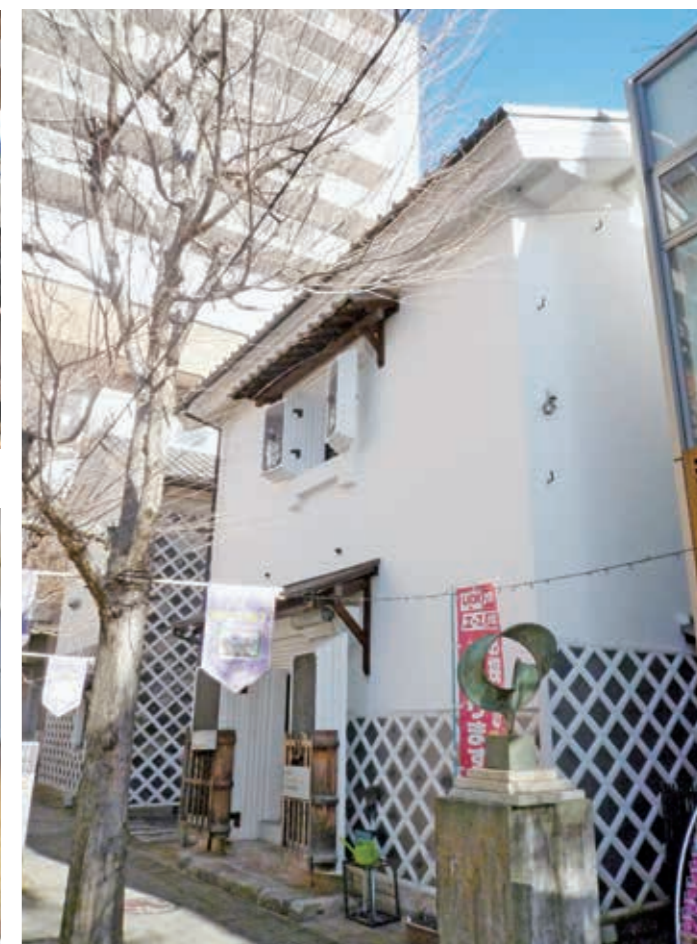
Renovated warehouse is used as management company office