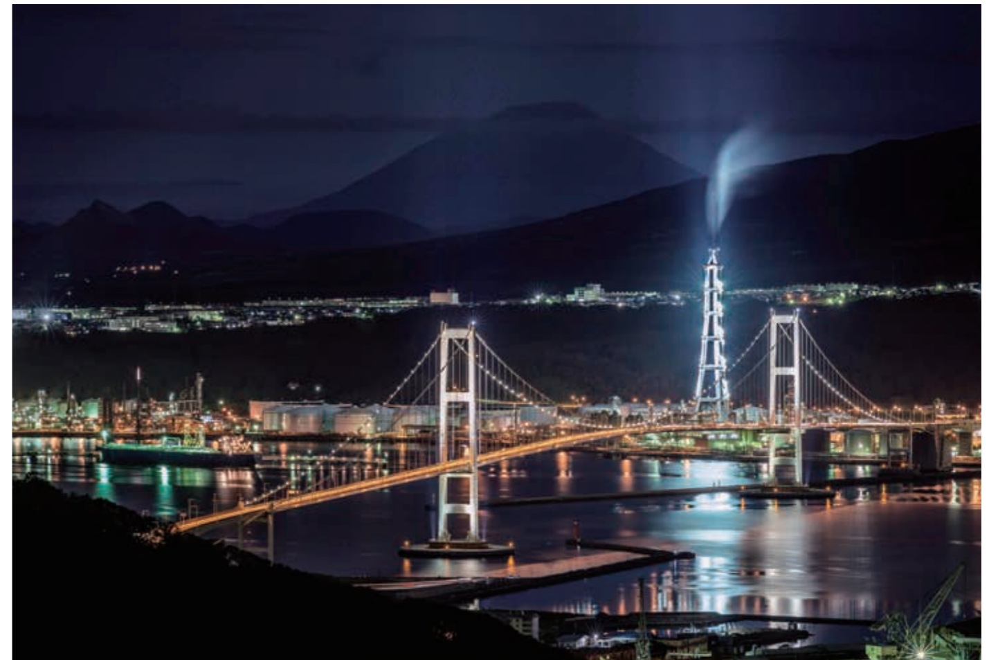
Illumination of Hakucho Bridge uses wind-powered LED lights

has added wind and solar generation to public facilities, created a biogas generation facility at a wastewater treatment plant in cooperation with a private company, and is planning to start one of the largest biomass power generation plants in Japan in 2020. In addition, to promote energy conservation, the city has pursued the conversion of streetlights to LEDs, starting with the illumination of the Hakucho Bridge, which is a central element of the nighttime industrial scenery popular with tourists. The city also provides support to families to jointly adopt fuel cells, solar power generation, home energy management systems, and LED lighting.”