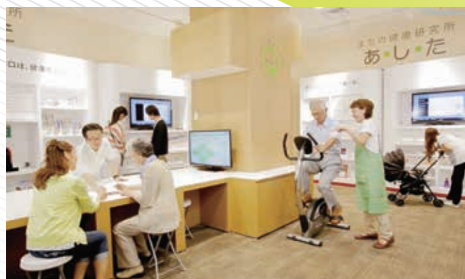
“To-mor-row” health support center

Finally, to achieve a city of new industry creation, a private company has opened one of the largest co-working spaces in the country, and Tx Entrepreneur Partners, a private venture capital organization, is engaged in cultivating startup companies.