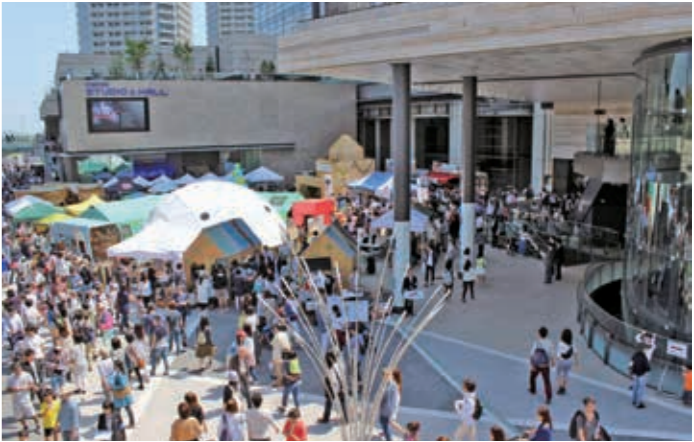
Public spaces host diverse events