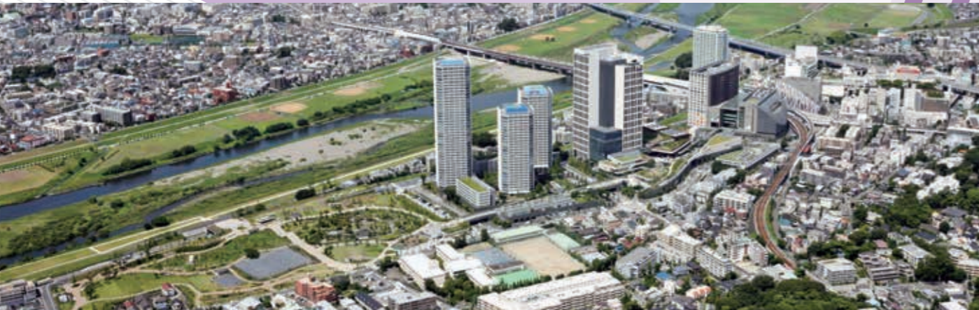
The entire district

This urban redevelopment project has resulted in an always-bustling area of diverse uses, including approx. 70,000 sq. meters of commercial facilities, approx. 80,000 sq. meters of office space, housing for 1,000 families, a bus terminal, and a hotel. The site also contains approx. 6,000 sq. meters of green roof space, part of 10,000 sq. meters of total green space, and has earned a LEED Neighborhood Development Gold Rank Certification recognizing the redevelopment's commitment to nature and eco-friendliness. The project aims to engender new demand in the inner