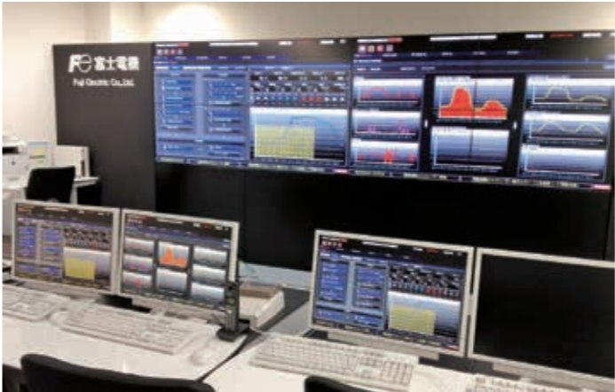
The district's community energy management system