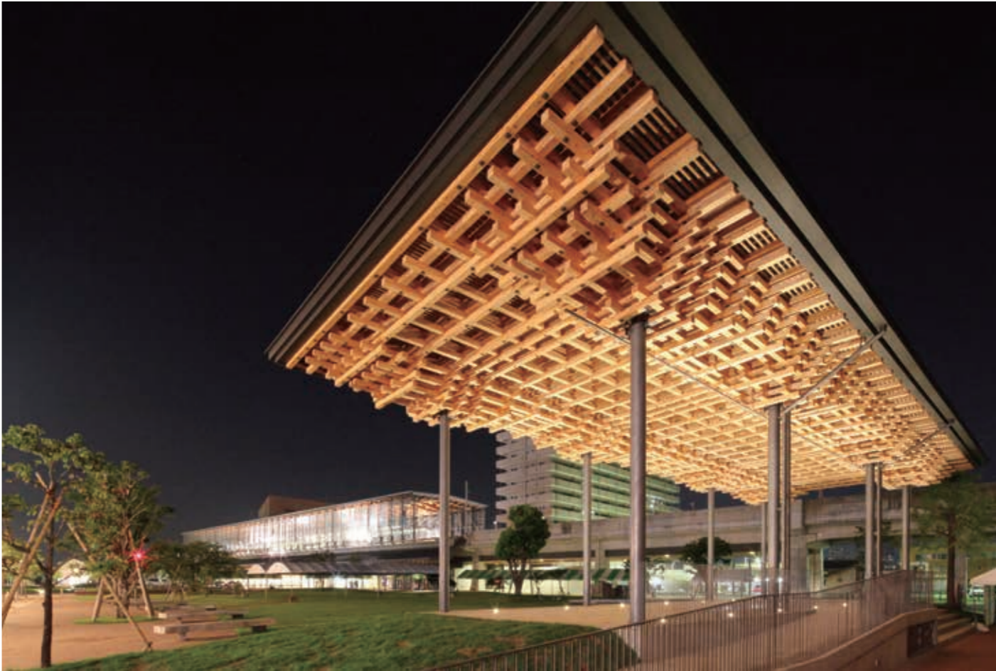
The outdoor stage is built from plentiful local cedar