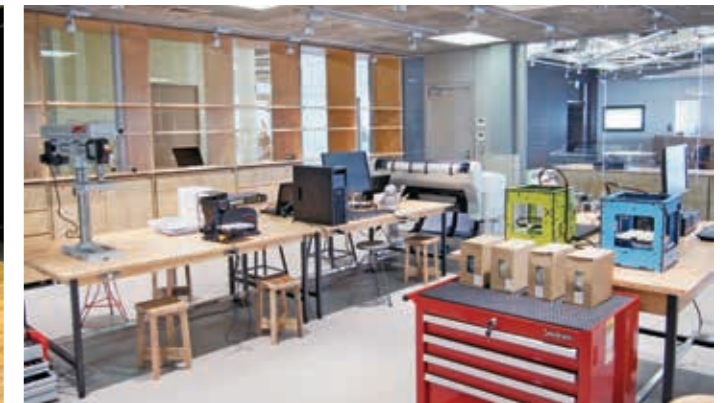
KOIL Factory digital manufacturing workshop