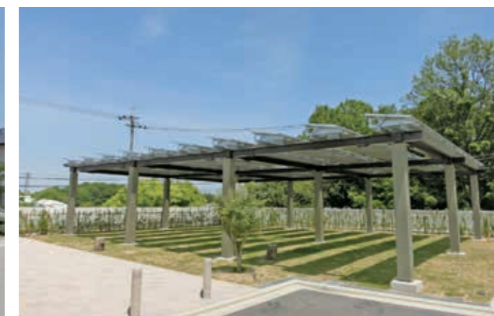
Solar energy system on shared facility