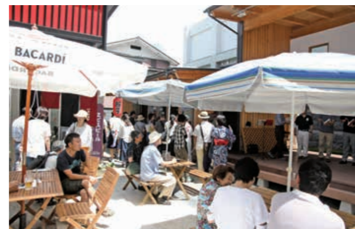
Open terrace at the center of the alleyway