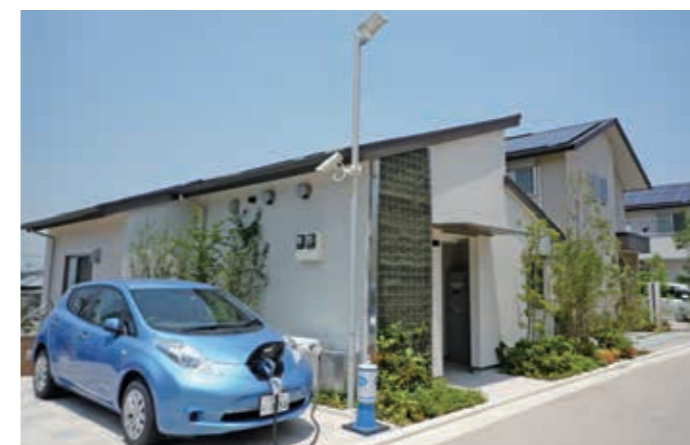
Shared electric vehicle