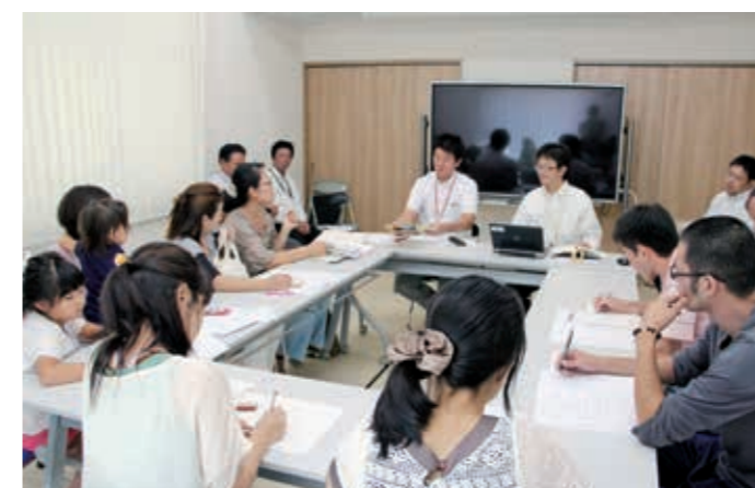
Neighborhood management association