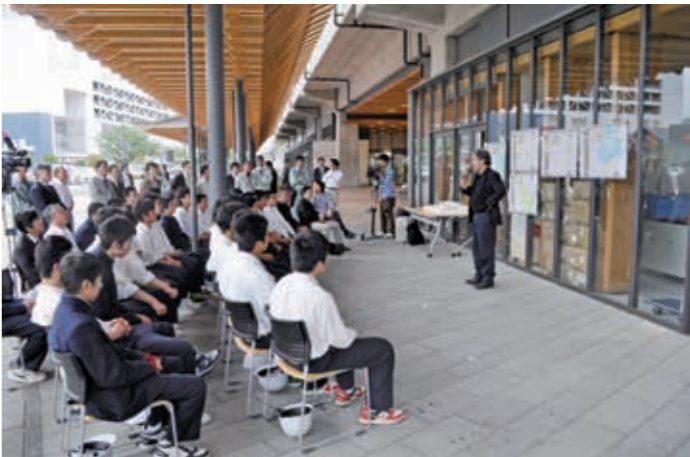
Town planning class for high school students