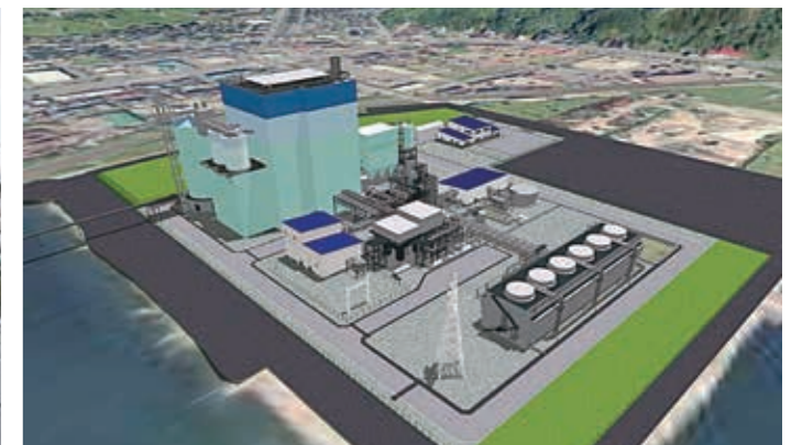
Biomass power generation plant fueled by palm kernel shells is planned to start operation in 2020