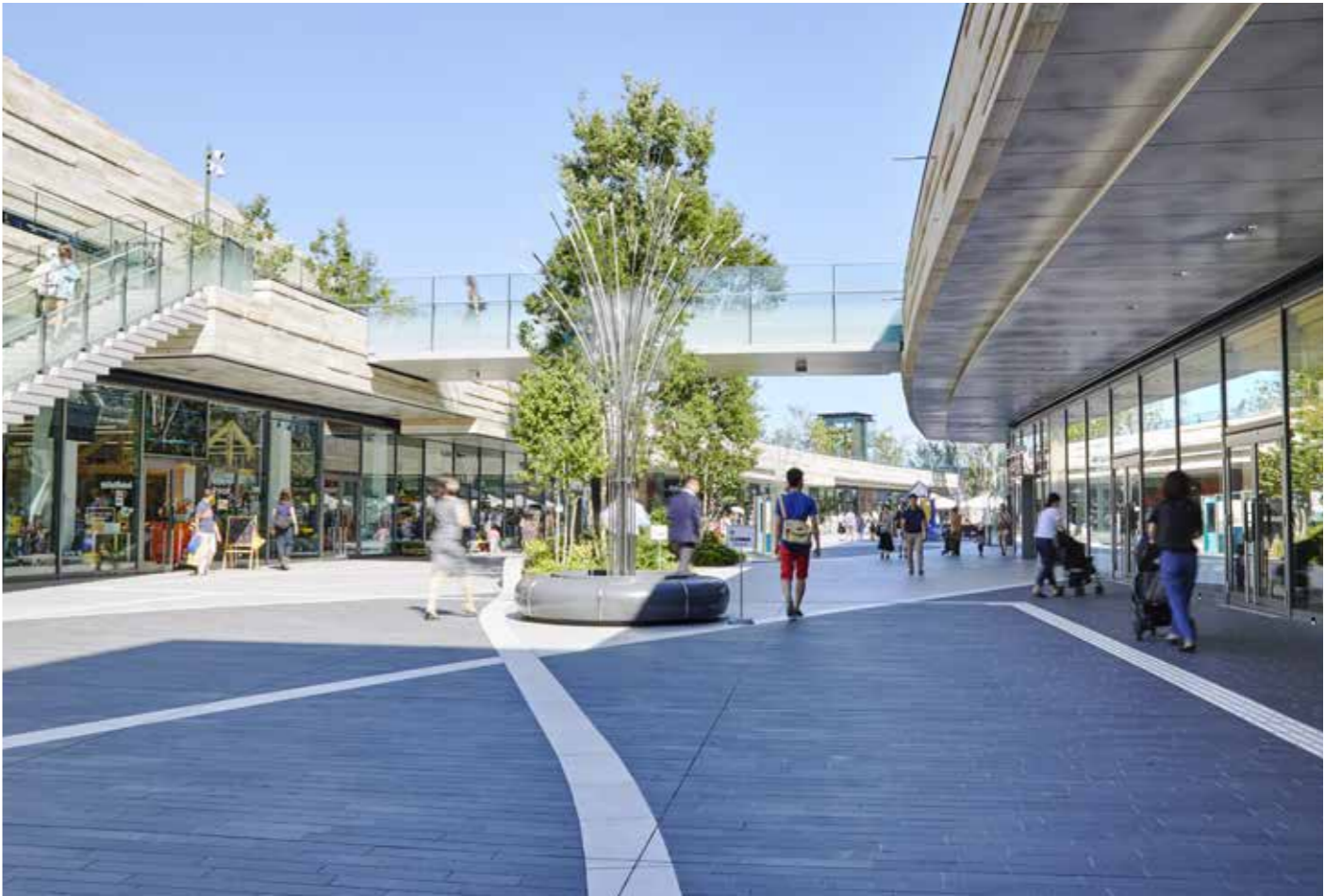
Ribbon Street walking path