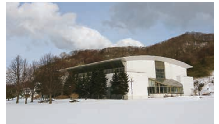
Municipal swimming pool equipped with household fuel cells