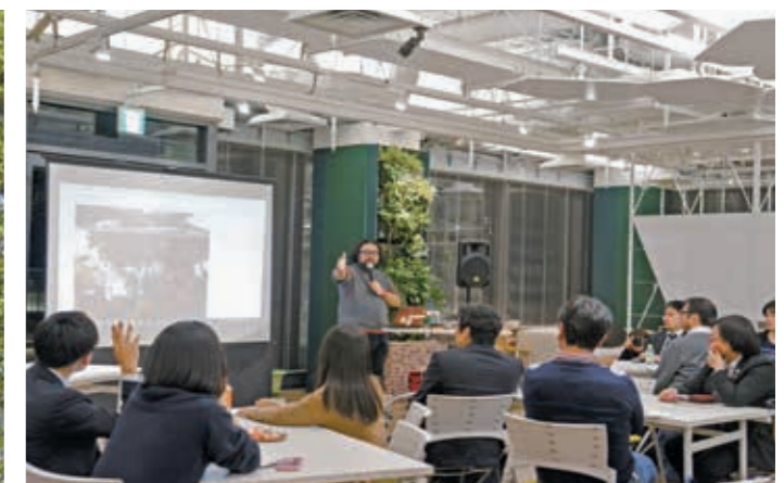
Seminar & event facility